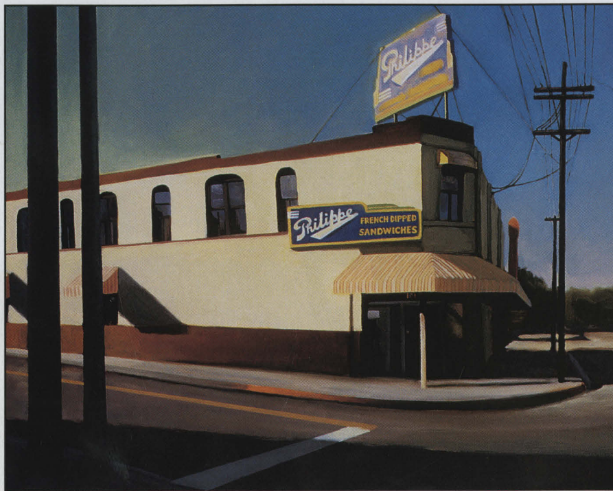
PHILIPPE'S BY TONY PETERS